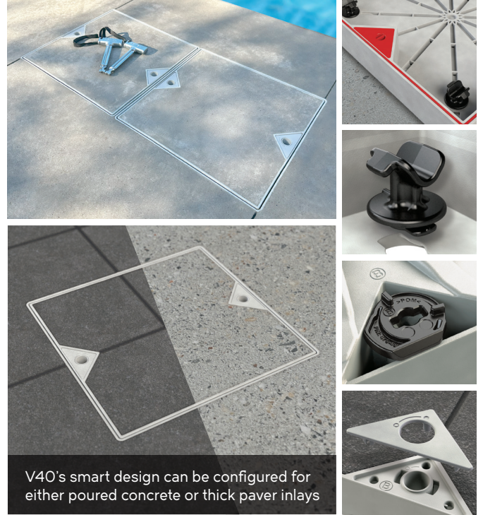
V40's smart design can be configured for either poured concrete or thick paver inlays

Scan this code to watch our series of helpful V-LOCK Lid videos.