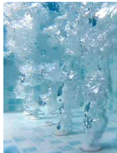
Closely spaced nozzles for an even spread of bubbles on water's surface

Closely spaced nozzles create a stunningly even spread of bubbles on the water's surface.