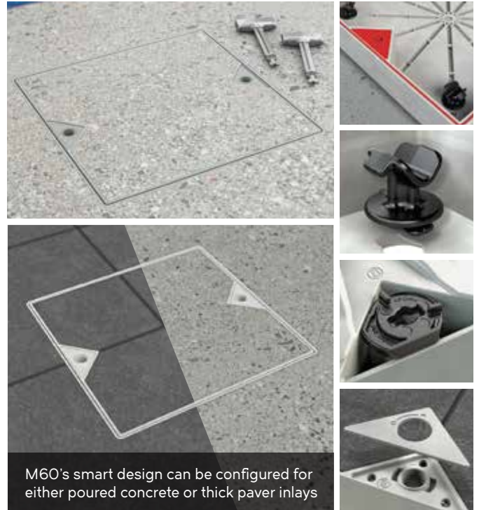
M60's smart design can be configured for either poured concrete or thick paver inlays

Scan this code to watch our series of helpful V-LOCK Lid videos.