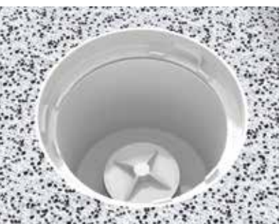
Superior access to central valve without obstruction.