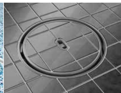
Flush-fit lid clicks securely in place and looks great.