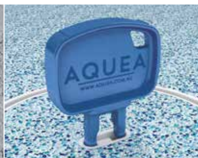
Easy lid assembly & removal with custom lid key.