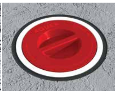
Construction cap helps keep niche clean during construction.